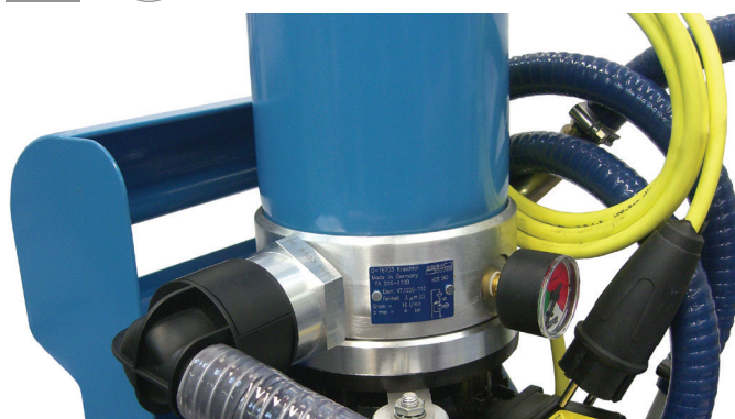
FA 016 with screwed-in suction strainer set FA 016.1775