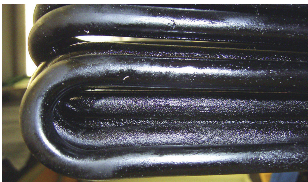
Oil aging products at tube bundles of an oil cooler